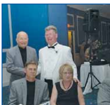
Just more pretty faces.