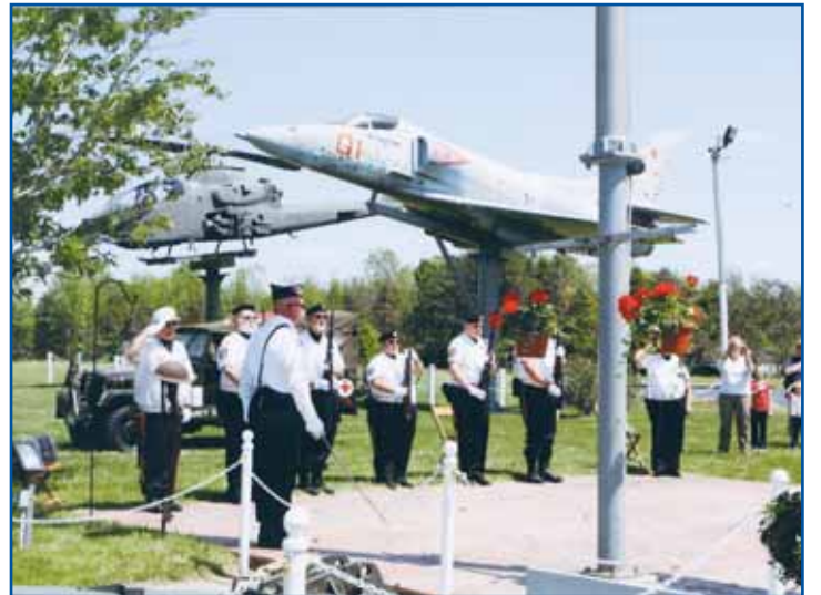
Post #1419 – Hamburg – Memorial Day Ceremonies.