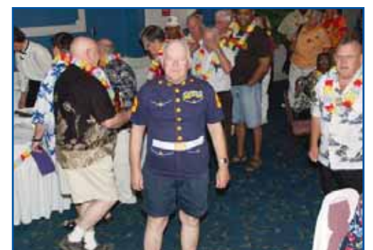
Formal dress code?