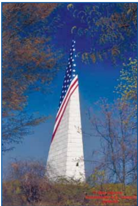
Vietnam Memorial, Farmingville, Suffolk County.