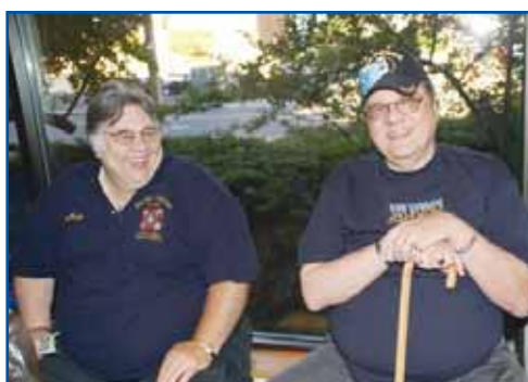
The NYC connection.