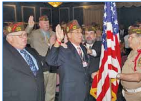
Newly elected officers being sworn in at the Department Convention.