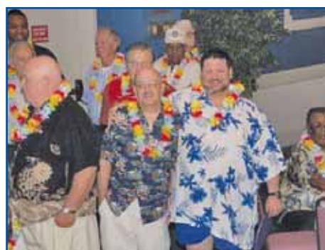
It was announced that everyone needed a date!