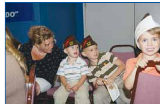
Yup, the VFW is for families and their kids.