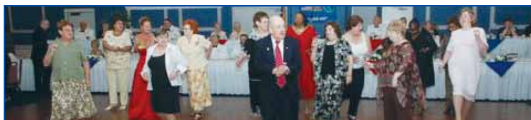
What's that song, "Leader of the Pack?"